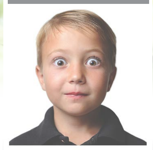
A standard dehumidifier uses HOW MUCH ENERGY?!

A standard dehumidifier uses about the same amount of energy as a refrigerator and clothes washer combined!