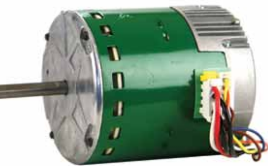
The Evergreen™ replacement ECM by Genteq®.

All fan motors are not created equal. Choosing the right motor for a home's heating, ventilation and cooling (HVAC) system can make a huge difference in energy efficiency, operating costs, comfort and indoor air quality.