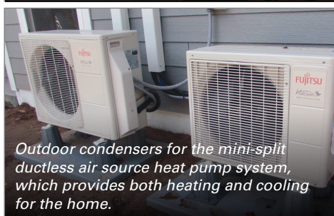
Outdoor condensers for the mini-split ductless air source heat pump system, which provides both heating and cooling for the home.

In addition to ICF construction, Piontek's featured home includes a high performance mini-split ductless air source heat pump, radiant slab heat, 100 percent LED lighting, ENERGY STAR® appliances and windows that exceed Triple E program standards. Plans were submitted and reviewed by Minnesota Power prior to construction, and program representatives visited the site for midterm and final inspections. The latter included a blower door test to check air tightness.