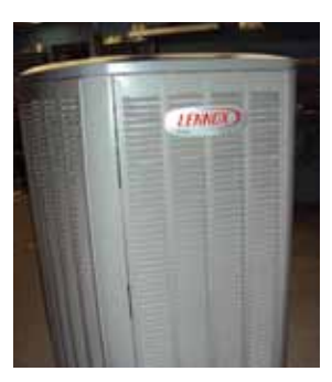
A split-system ASHP unit pays for itself over time with energy savings.

cont. There are two basic types of ASHPs—furnace integrated (also called split-system) and mini-split ductless. Furnace integrated ASHPs are installed in homes with traditional forced air furnaces and existing ductwork. Mini-split ductless systems are recommended for homes with electric baseboard, slab or hot water heating.