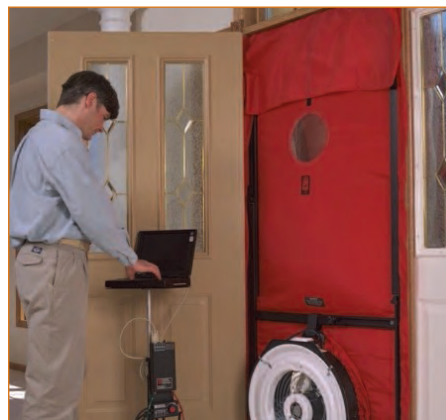
Two common tools in house diagnostics are infrared cameras and blower doors. (Top) Infrared thermal images show surface temperature variations that may indicate air leakage paths (bypasses), inadequate insulation, or moisture in building materials. (Bottom) Blower doors test the air leakage rate of a building.

Energy conservation is a popular topic these days. Rising fuel prices and growing environmental concerns have many people looking for ways to lower their energy use and reduce their impact on the planet. Remodeling or upgrades that improve the energy efficiency and overall performance of their homes is a great place to start.